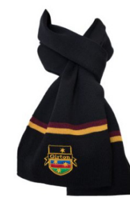
Scarf (optional - not to be worn at formal events)