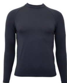
Rashi - long sleeved