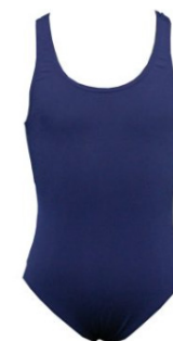
Bathers - girls