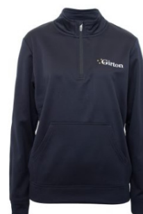
Quarter zip top