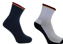
Socks navy or white