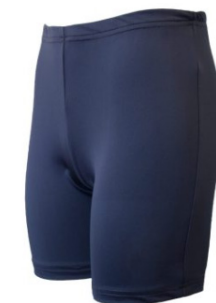
Bathers - jammers