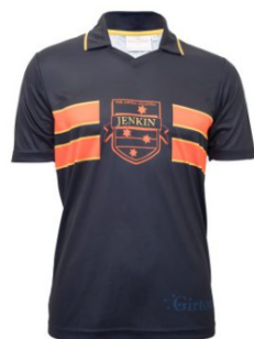
House polo shirt