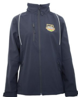
Soft shell jacket