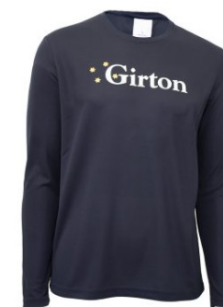
Training top long sleeved