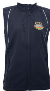
Soft shell vest