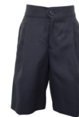
Shorts junior elastic waist