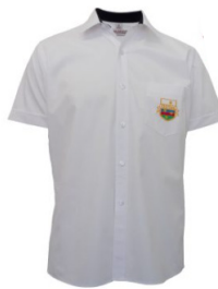
Shirt short sleeved