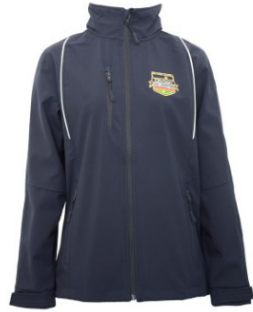
Soft shell jacket