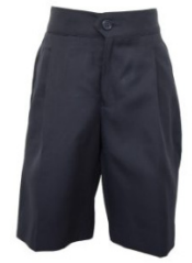
Shorts junior elastic waist