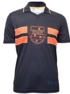
House polo shirt