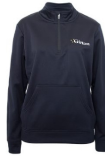
Quarter zip top