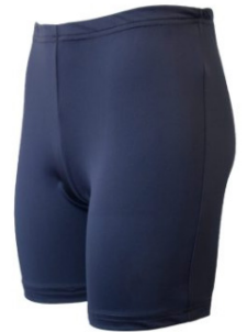
Bathers - jammers