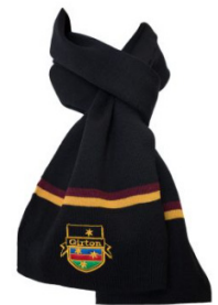
Scarf (optional - not to be worn at formal events)