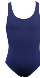
Bathers - girls