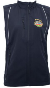
Soft shell vest