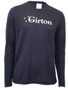
Training top long sleeved